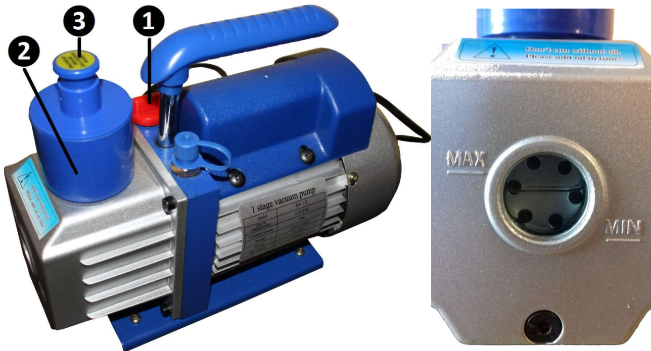
Elements of the vacuum pump and correct oil level

The pump delivered to the client is never filled with oil. A little amount of oil in the oil sight glass indicates only the fact that the pump was tested before the shipment. The pump must necessarily be filled with oil before use.